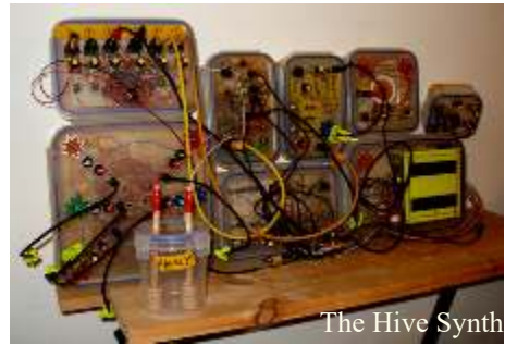
The Hive Synth